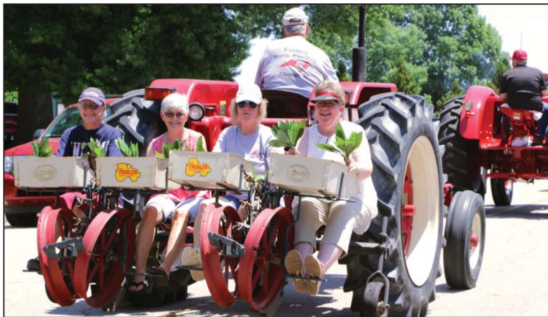
The Got to Be NC Festival is looking for tractor owners and clubs to participate May 18-20.