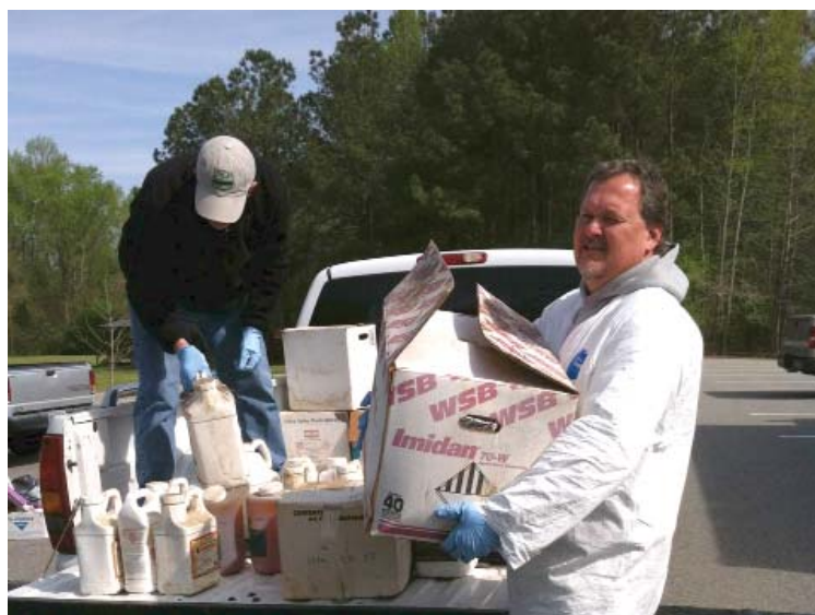
Unwanted pesticides are collected and properly disposed of through collection day events held by the Pesticide Disposal Assistance Program.

"We are proud that this is the first program of its type in the na-