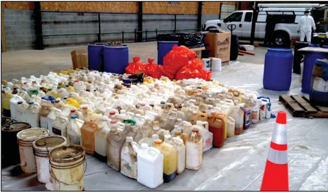
The Pesticide Disposal Assistance Program has been around for 37 years, but still continues to collect and dispose of significant amounts of unwanted pesticides. This photo is from a collection day held in Johnston County. Collection events are held across the state and are arranged through county cooperative extension offices.

The program is paid for through the Pesticide Environmental Trust Fund, which receives money through registration fees that companies pay on each pesticide product sold in the state and through an appropriation from the General Assembly.