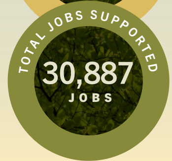
TOTAL JOBS BY SECTOR