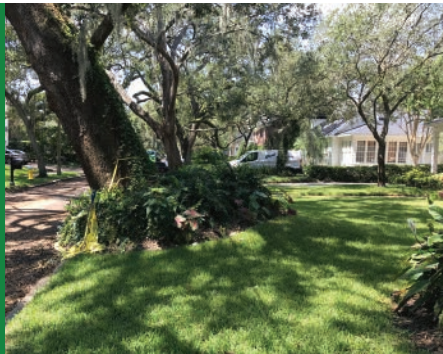
Root Zone — Leaning tree. Not all leans are dangerous. If the ground around the base is not cracked and moving, have your qualified arborist inspect the tree. If the ground is cracked and moving, remove the tree.