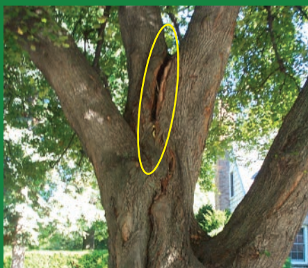
Main Scaffold Branch Attachments — Cracks. Remove tree.