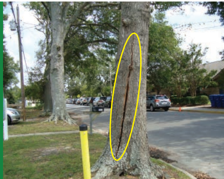
Trunk — Cracks that are moving or associated with a cavity or decay are dangerous. Have your qualified arborist inspect the tree.