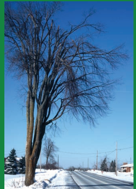
Branches — Broken and hanging in the tree (hanger). Remove hangers.