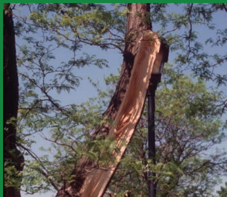
Branches — Split or rips as pictured here. Remove the branch.