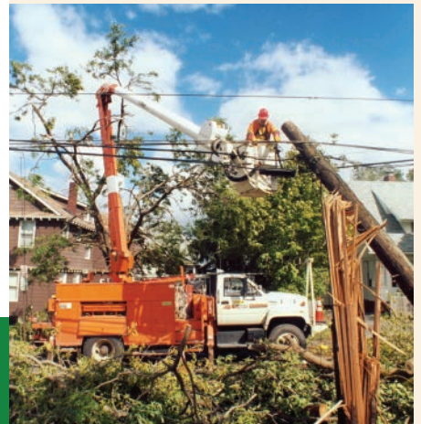
Downed debris entangled with utility lines will require coordination with local utilities to safely remove the debris. Inspectors will notify Planning to coordinate.