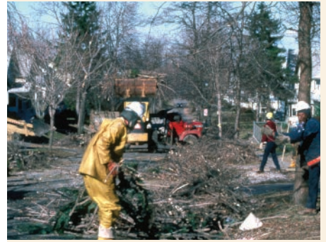
Downed debris can be cleared like a leaf collection or snow removal operation. Debris can be cut, piled in the road and pushed to intersections for loading and hauling.

The following photographs below illustrate typical storm damage that may present a safety risk and should be addressed during the emergency or response phase. Also see NCFCS Storm Damage Tree Assessment BMP.