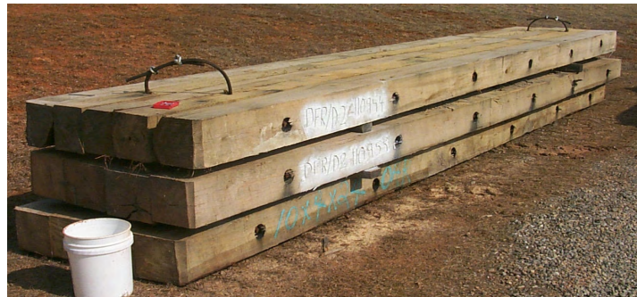
Figure 2: New bridgemats with ID codes installed

Inspection of these same bridgemats after nearly two years indicates that coding the panels with the router was successful. As seen in Figure 3, the lettering is still visible, while the surface of the mats is so scarified that repeated applications of paint and/or labels would have been needed, thus requiring additional supply and personnel costs. The photos below were taken in October of 2002. Methods of labeling steel mats will be considered; one method is to apply codes with a weld bead, located somewhere so the beads will be somewhat protected. Additional painting may also be attempted.