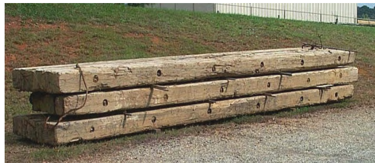
Figure 4: Bridgemats after 2+ years use