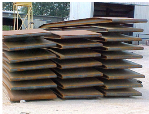
Figures 5a & 5b: New Steel Bridgemats in North Carolina Awaiting Pickup by Customers

From several conversations with individuals in the forestry, logging, and timber community, it appears that purchases of bridgemats have thus far been accomplished by one of three methods, listed here in no order of frequency or significance: