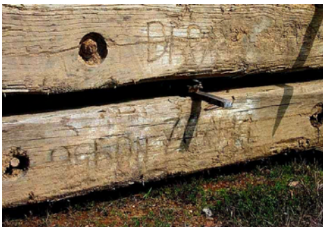
Figure 3: ID codes after 2+ years

Inspection of these same bridgemats after nearly two years indicates that coding the panels with the router was successful. As seen in Figure 3, the lettering is still visible, while the surface of the mats is so scarified that repeated applications of paint and/or labels would have been needed, thus requiring additional supply and personnel costs. The photos below were taken in October of 2002. Methods of labeling steel mats will be considered; one method is to apply codes with a weld bead, located somewhere so the beads will be somewhat protected. Additional painting may also be attempted.