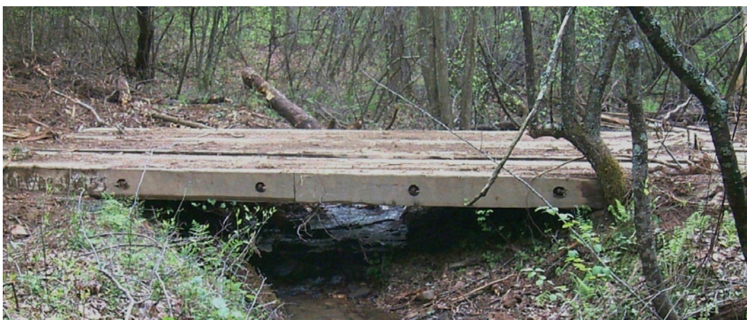
Figure 7: Properly installed wooden bridgemats in western North Carolina

Even during dry times with little or no water in a channel, using a bridge of some kind will protect the stream or ditch bank structure, thus preventing accelerated erosion during rain events that occur after the logging or forestry activity is complete. Also, the conditions of the stream or ditch bottom will be protected when using bridgemats by avoiding soil compaction and rutting which can result in degradation of water quality, and habitat quality for fish and aquatic organisms.