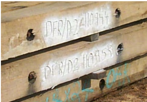
Figure 1: Freshly applied ID codes

When the most recent sets of wooden bridgemats were received in 2000, a test was performed to “brand” each panel with marks that would identify them as DFR property. Alphanumeric property codes were routed into one side-edge of each panel to a depth of 0.5 inches, with each panel assigned its own unique code. Routing this information into the wood was thought to be the best long-term method of labeling each panel. The routed area on the new mats was also coated with white or yellow paint as an additional tool to quickly identify the mats once positioned on-site, and to serve as a test to determine the practicality of using paint.