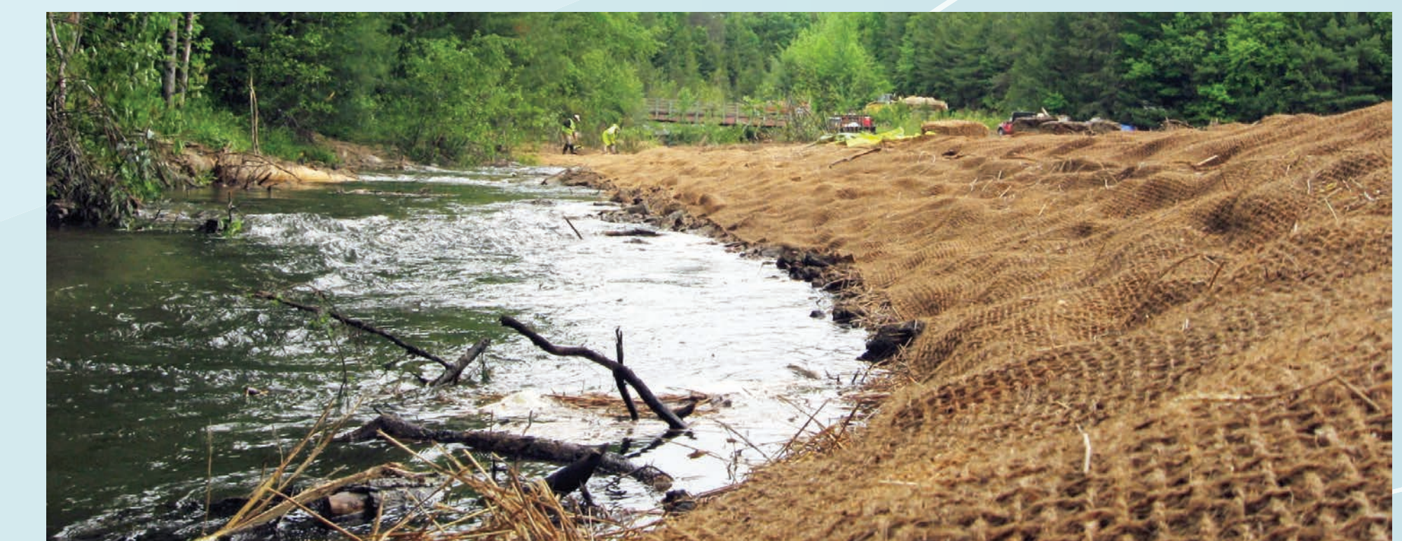
Downstream, looking back towards the bridge. The new streambank gradually slopes upwards and is stabilized with fiber netting.