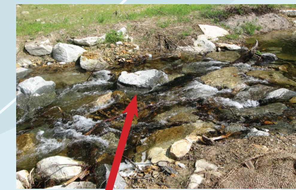
Riffles dissipate the water's energy, add habitat, and increase the oxygen in the stream.