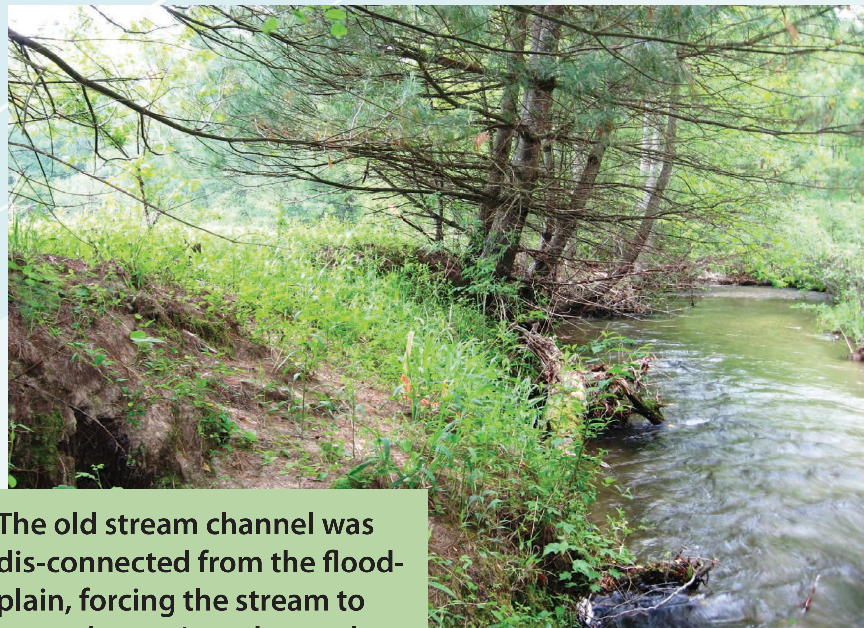
The old stream channel was dis-connected from the floodplain, forcing the stream to carve deeper into the earth.