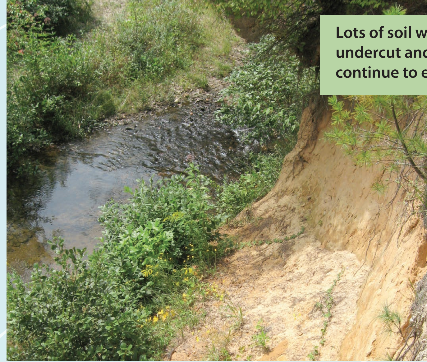
Lots of soil was washing into the stream. Trees were being undercut and falling down, causing the embankment to continue to erode