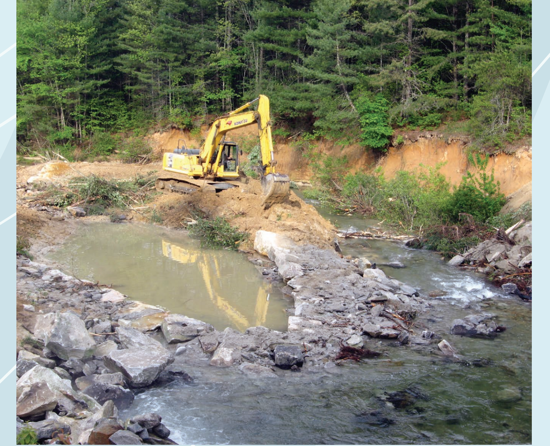
Building up a boulder vane structure.