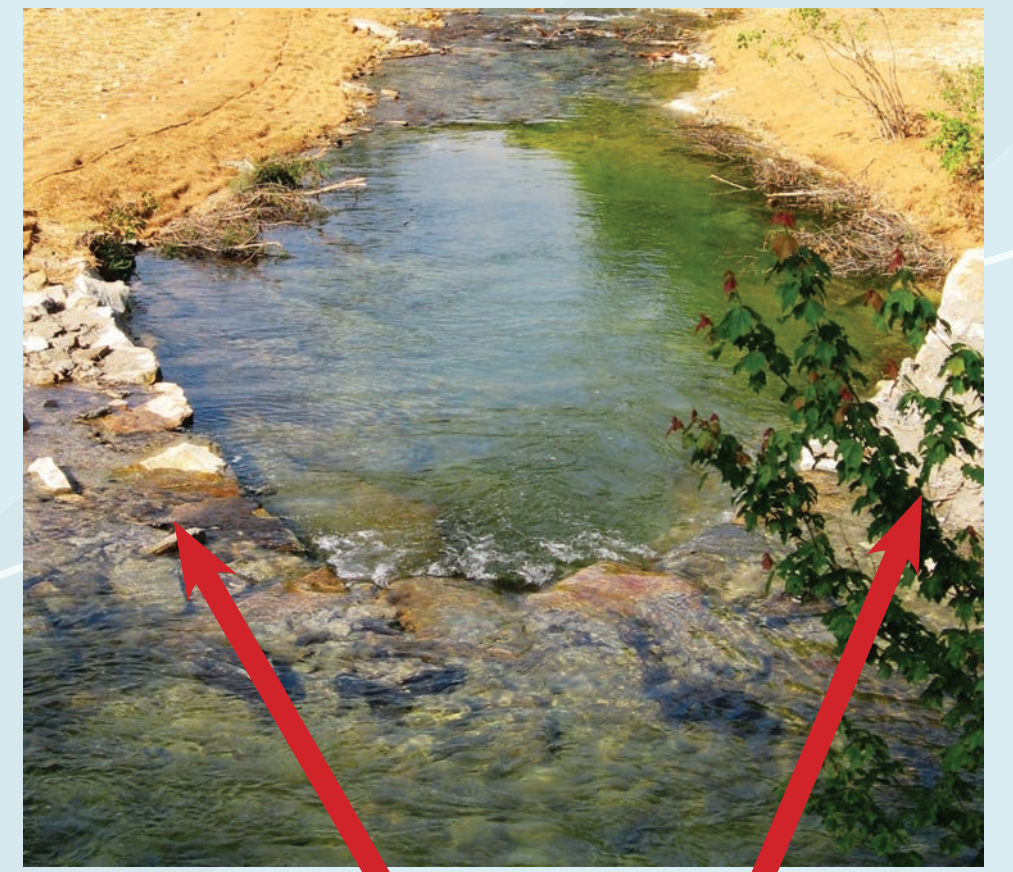
Boulder vanes focus the stream flow towards the center of the channel.