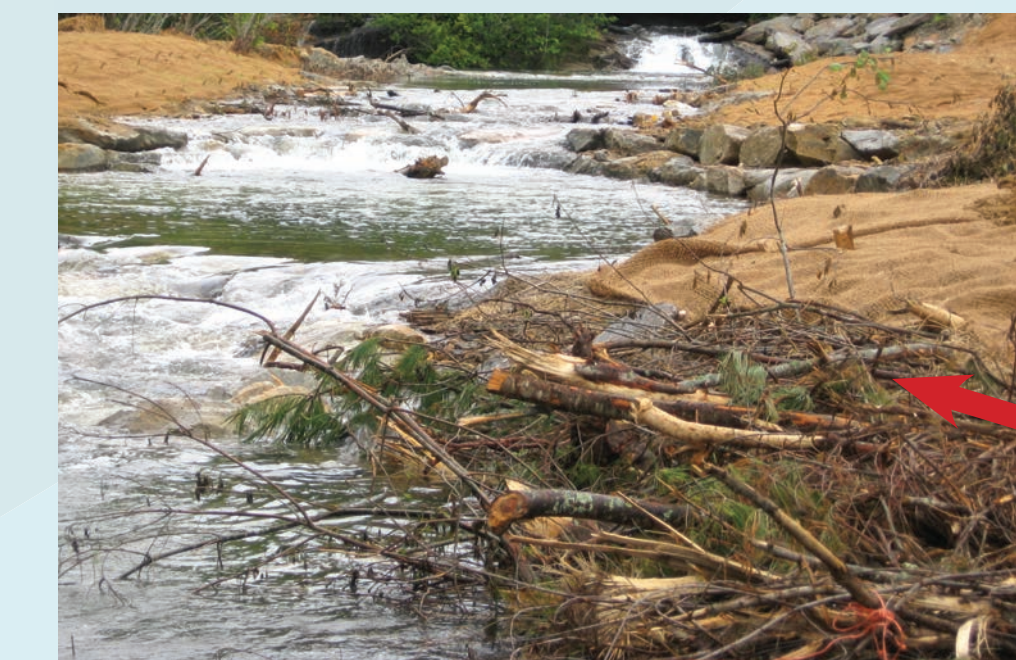
Limbs and brush anchored into the streambank provide shelter for fish and beneficial aquatic insects which the fish use for a food source.