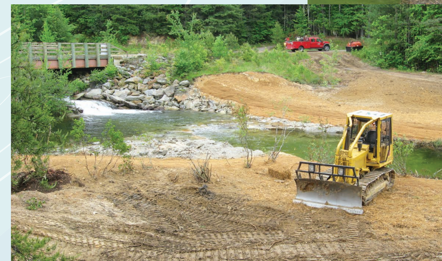
Almost done, awaiting grass seed.