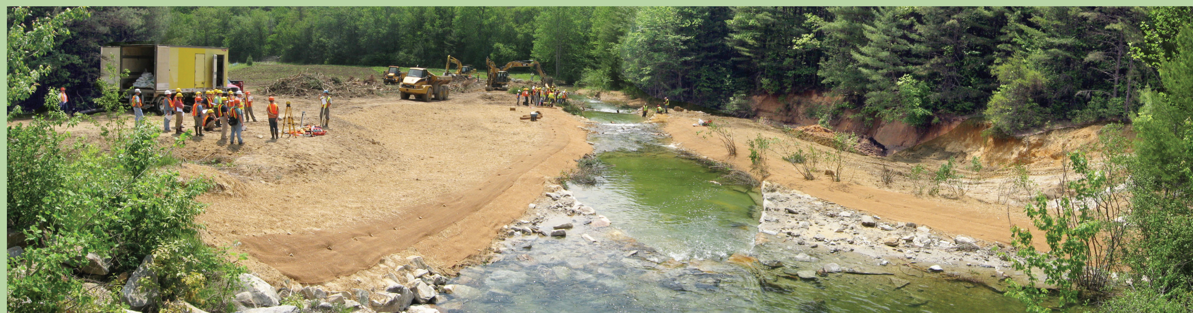
Our partners from NCSU held a workshop for stream restoration experts near completion of the work to show off the techniques used here.

Nearly 600 feet of stream was restored. This stream flows into the Little River, which is frequently visited for trout fishing. Fixing this stream will help to protect the trout habitat in the Little River. Even though we had to remove trees along the left-side of the streambank, new planted tree seedlings will help to re-forest the stream corridor. The new streambanks have been sloped back at a gradual angle to allow water to more easily rise out of the stream channel during storms and re-connect with its natural floodplain area. Allowing a stream to reach out into its floodplain will minimize flooding damage further downstream.