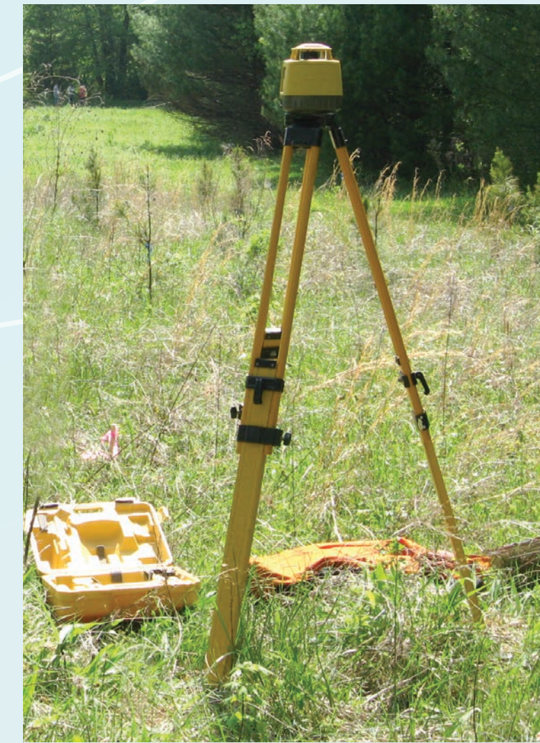
Surveying & clearing a new stream path.

The old stream was created when Lake Julia was built in the 1960's. But, because this channel was not located in the naturally flat floodplain, the force of the water over time had cut away sections of the old embankment along the right-hand side.