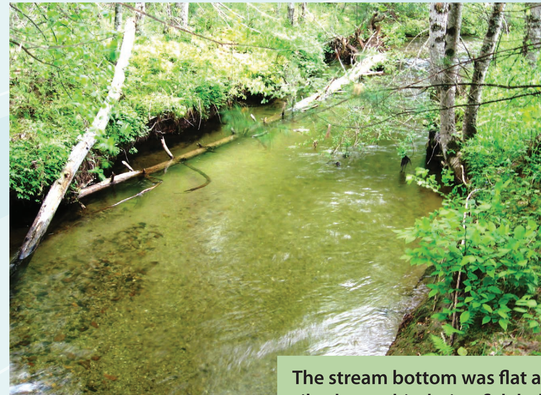
The stream bottom was flat and silted-over, hindering fish habitat.