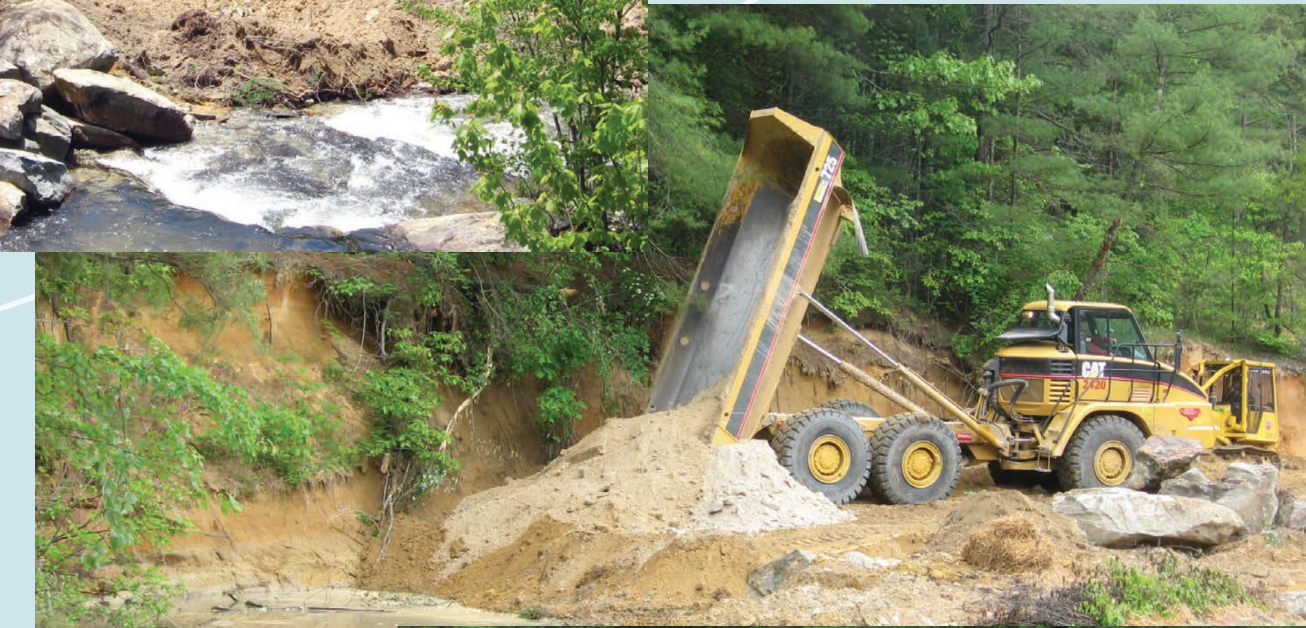
Filling in the old channel.