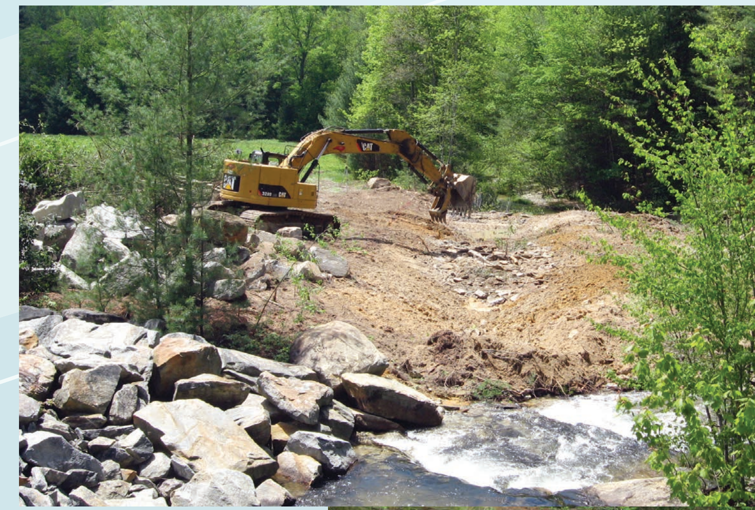
Excavating a new stream channel.