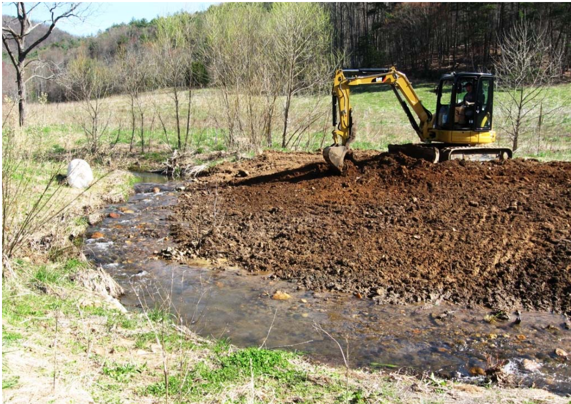
Photo 3: Reconfiguration of the stream's left bank is shown above, April 2010.