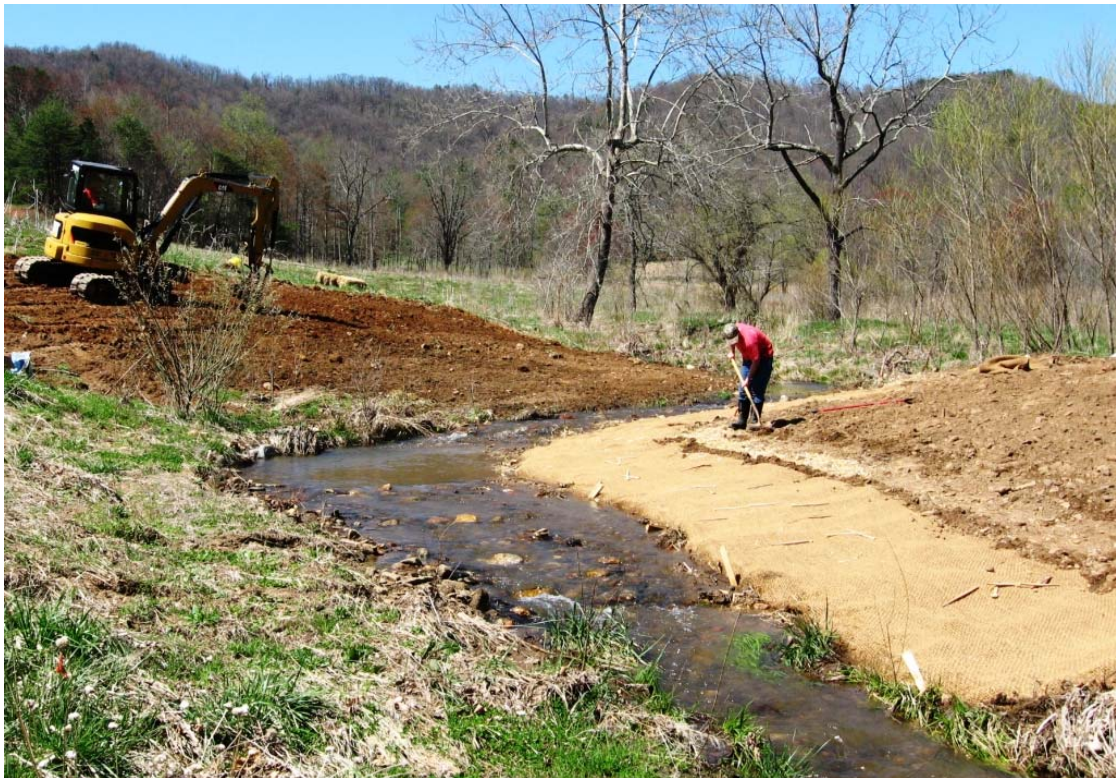
Photo 4: Stream left bank has been reconfigured, with the toe of the bank lowered in elevation and the slope reduced, allowing easier floodplain access by high water flow. Final grading and erosion control work is shown above, April 2010.