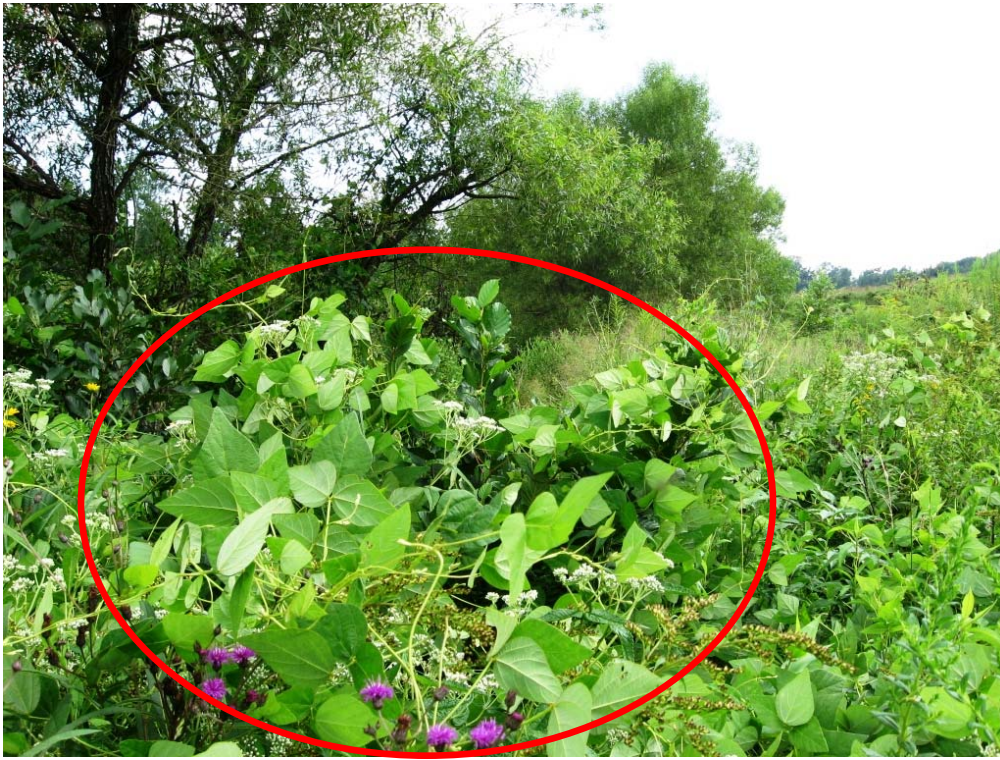
Photo 11: Kudzu (circled) along a section of Phase 2 on the right bank, shown in August 2010.