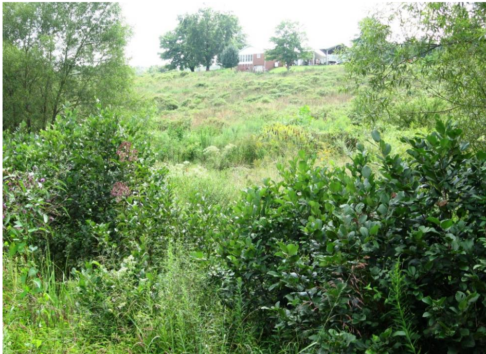
Photo 9: Same location, shown August 2010. Note the abundance of vegetation providing shade alongside the stream, including alder and black willow that were retained during restoration.