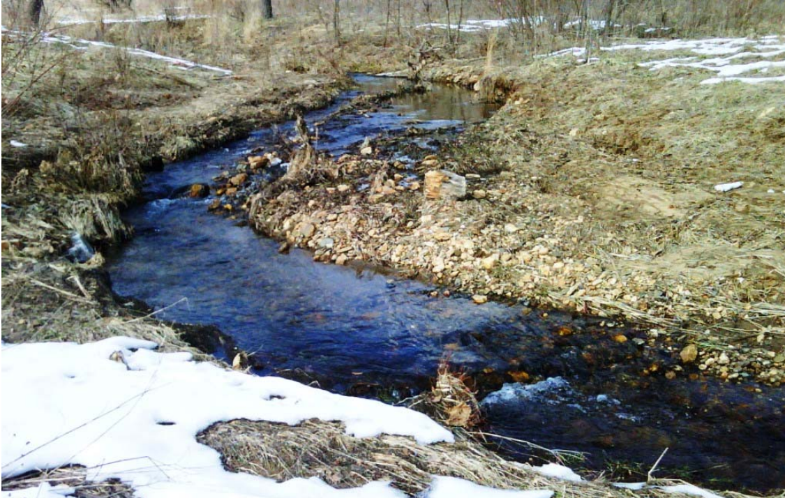
Photo 1 above & Photo 2 below were taken in February 2010. They both show the partially scoured stream bank which required reconstruction. Photo 1 is looking upstream; Photo 2 was taken while standing on right bank.

Overall morphology appears intact. No channel surveys were conducted in 2010, but are planned for 2011. Minor reconstruction of a meander bend within the restored stream was completed in April. The inside of the meander had been scoured away from high water flows, and a portion of the outer meander stream bank had also been scoured and partially undercut. Reconstruction work lowered the inside meander bench and deepened the pool within the bend. Erosion control (coir) matting was installed on the newly exposed soil and the area was successfully seeded with erosion control grass. Seed sources from nearby native mature hardwood trees are anticipated to provide woody vegetation regeneration.