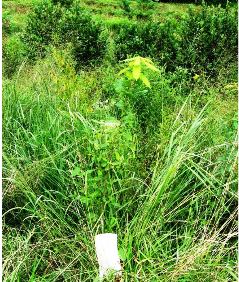
Photo 10: A swamp chestnut oak ( Quercus michauxii ) along Phase 2 shown in August 2010, 2½ years after planting.

No tree tally plots were conducted along Phase 1 (UT) of the project. However visual monitoring of this restored stream indicates an abundance of tree regeneration due in part to the close proximity and large number of mature trees alongside much of the tributary's length, in addition to the adequate survival of planted seedlings and shrubs.