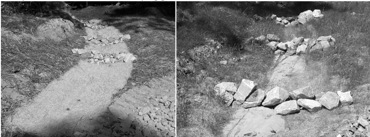
Erosion control matting was installed within this turnout that also had check-dams installed to capture sediment runoff. The left photo shows the matting and check dams recently installed. The right photo shows the stabilized turnout and captured sediment.