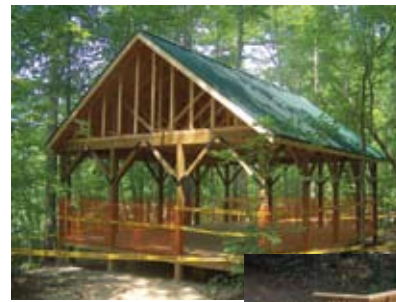
The Lowe's Home Improvement Charitable and Educational Foundation provided a generous donation towards construction of the riverbasin deck (below) and NPS pavilion, shown at left still under construction.