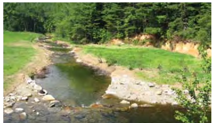
A portion of the right bank was kept exposed to retain swallow nest cavities in the earthen embankment.

Cooperative funding and technical assistance for this restoration were provided by these partners: