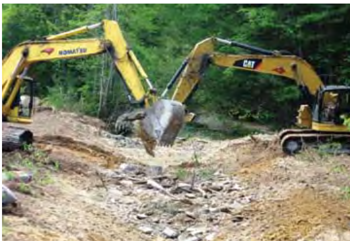
A new stream channel comes to life!