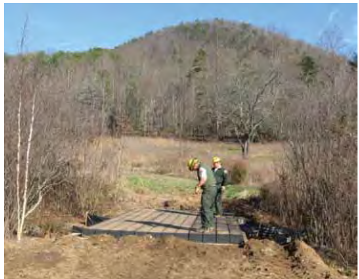
Two views showing the bridgemat demonstration area safely and successfully installed.