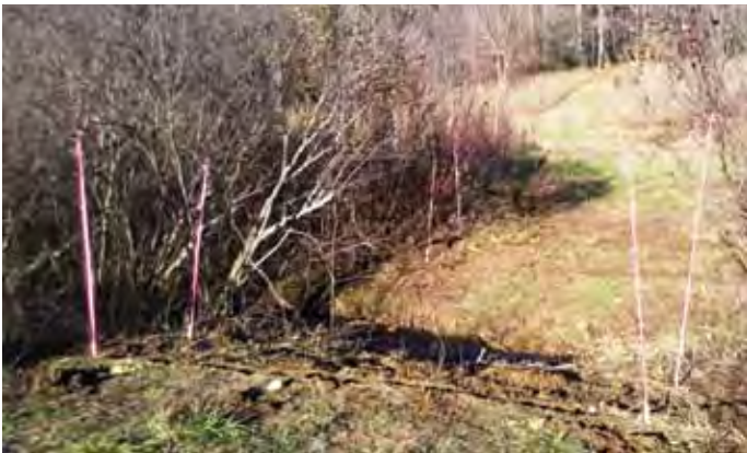
The stream crossing location prior to bridgemat installation.