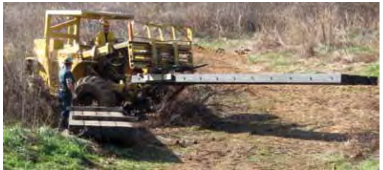
The first panel carefully being maneuvered into position.