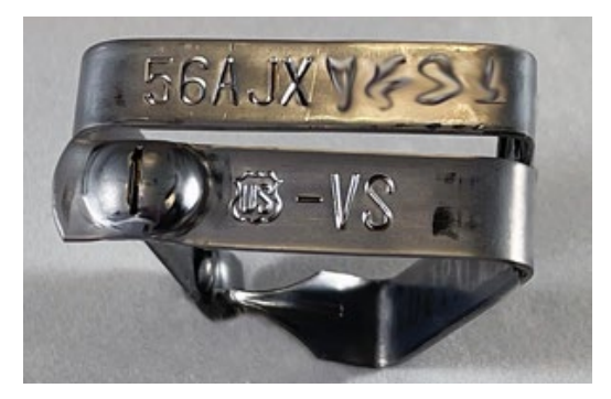
NUES tag - also referred to as a "Brite tag"

This fact sheet contains information from the North Carolina Department of Agriculture regarding Electronic ID tags and the USDA APHIS Animal Disease Traceability final rule effective November 05, 2024