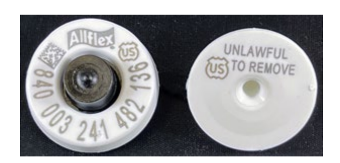
EID (electronic ID) or RFID (Radio Frequency ID) Also referred to as an "840 tag"

A NUES tag (Brite tag) will be recognized as official ID for the life of the animal if the tag was applied before November 05, 2024.