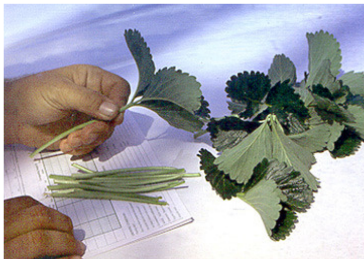
Fig. 2. Collecting a strawberry sample for plant tissue analysis.

Immediately detach petioles from the trifoliate leaves. This action stops nutrient transfer between the two plant parts, which are analyzed separately and for different purposes. Leaf analysis detects nutrient deficiencies and imbalances within the plant—it reports the nutritional condition of the plant. Petiole analysis is more sensitive to changes in available soil nitrate, which allows for a more precise nitrogen rate recommendation that is responsive to changing soil nitrogen conditions.