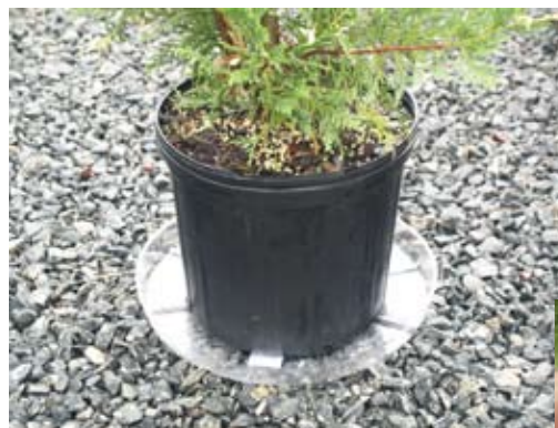
Elevate each container ½-inch above the saucer.

2 Irrigate nursery containers to container capacity (expect 10 to 20 percent leaching). Wait until after a normal irrigation event is completed rather than hand watering. This provides a sample based on the actual amount of irrigation received by plants.