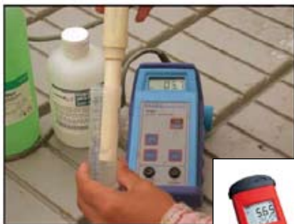
Equipment examples: EC/pH meter and pens

8 Calibrate the pH and EC test equipment using manufacturer's descriptions and appropriate buffers and standard solutions. Sachets (pictured below) are one-use packets, which make calibrations easy in the field.