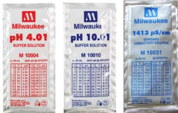
Buffers and standard solutions come in one-use packets.