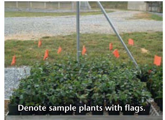
Denote sample plants with flags.

1 Sample blocks of plants by collecting leachate in a diagonal or “X” pattern depending on the size of the block. Larger blocks will require more plants sampled. To produce a trend over time, sample the same containers (or near them) at each collection date. Denote sample plants with flags. Alternatively, choose a few plants randomly for spot checks.