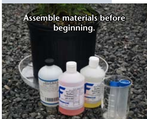
Assemble materials before beginning.

5 Gently pour 120 milliliters (4 oz) of water over the surface of a 4-liter (1 gallon) container or grow bag. Pour 350 milliliters (12 oz) over the surface of a 12-liter (3 gallon) container or bag. For larger container sizes, see Table 1.