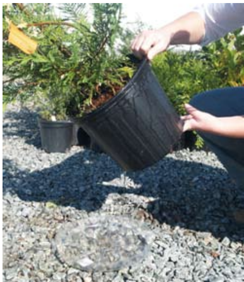
Another way to obtain leachate is to lift and tip containers.

6 An alternative for nursery containers is to lift and tip containers to drain leachate into a collection vessel. This can be done 30 minutes after irrigation has been completed.