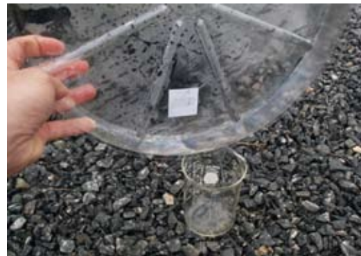
Pour leachate into a container that is deep enough to hold the test probe.

6 An alternative for nursery containers is to lift and tip containers to drain leachate into a collection vessel. This can be done 30 minutes after irrigation has been completed.