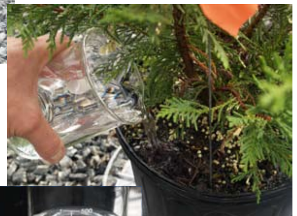
Pour the proper amount of water over the surface.

4 Before pouring water through containers, place containers to be tested in a shallow saucer to collect leachate. Try to elevate the container above the saucer (½-inch) for best results. Saucers used for house plants contain ridges to keep plants elevated slightly.