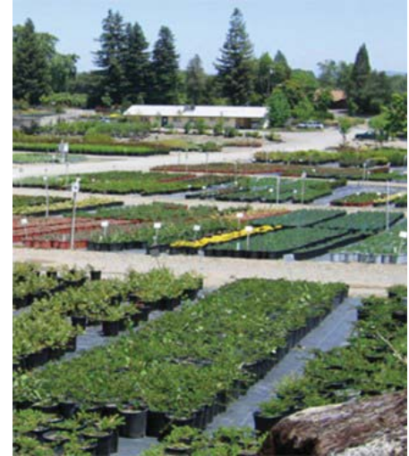
Containerized nursery plants grown outside the greenhouse environment have the potential for IFA infestation.

Certificates authorizing movement of regulated articles are issued by quarantine officials when certain approved procedures have been utilized to ensure that the regulated article(s) are free from IFA infestation. See page 18 for a complete listing of State plant regulatory officials and USDA State Plant Health Directors.