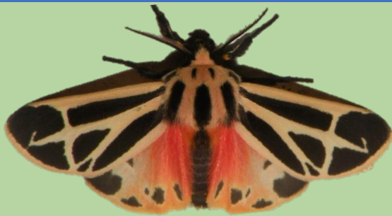
tiger moth Apantesis spp.