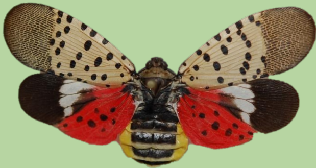
adult spotted lanternfly Lycorma delicatula

Non-native, invasive insect | Agricultural, ornamental, and nuisance pest Report photos of suspected spotted lanternfly at NCAGR.GOV/SLF