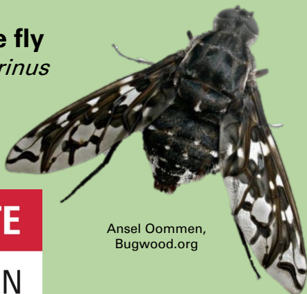
tiger bee fly Xenox tigrinus