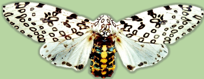
giant leopard moth Hypercompe scribonia

The insects below are native to North Carolina and do not need to be reported.