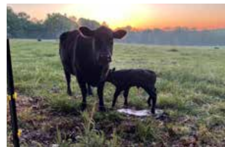
Crooked Fence Farms