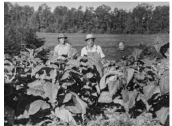
The Mise Farm