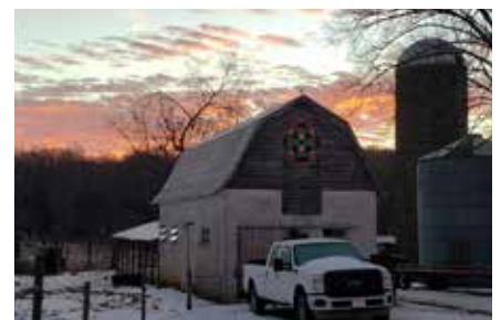
Spring Crest Farm