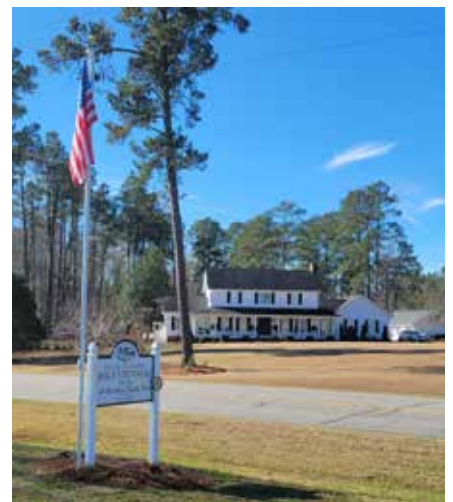
Strickland Family Farm