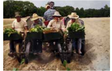
Marshburn Family Farm