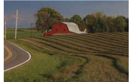
June Bug Farms