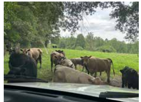
Hare Heritage Farm