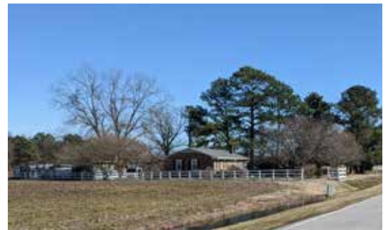
Sauls Family Farm