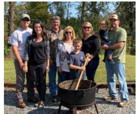
Kernodle's Blueberry Farm