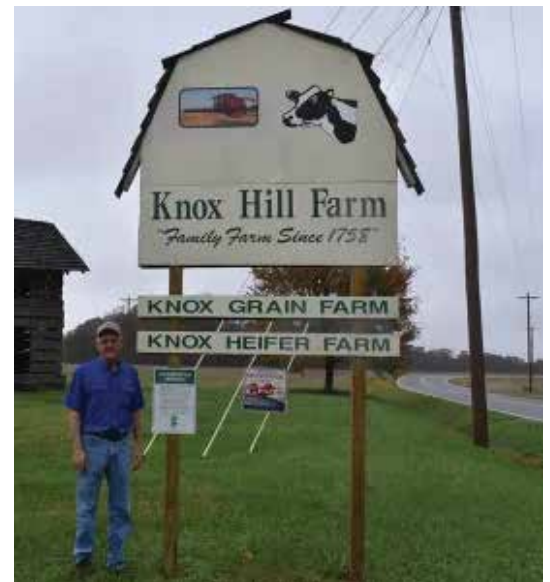
Historic Knox Farm