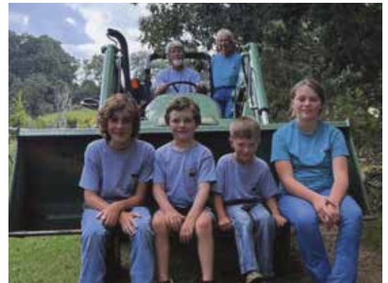
Magnolia Hill Farm