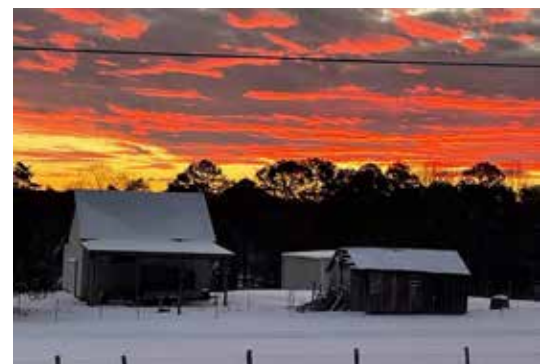
Winebarger-Sigmon Family Farm