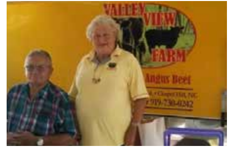
Valley View Farm