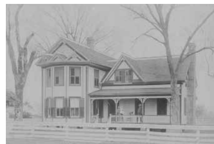
Jennette Family Farm