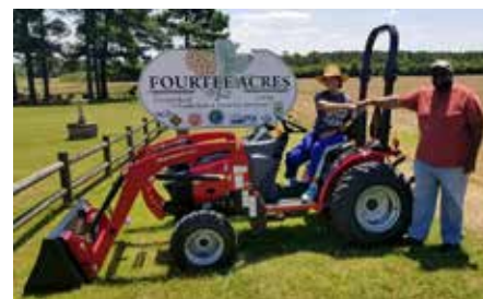
Williams Family Farm