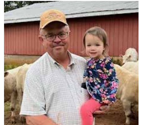
Martins' Charolais Farm