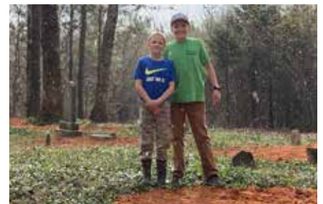
The Craven Farm