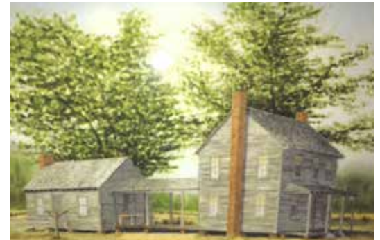
The Old Home Place Farm