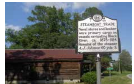
Clear Run Plantation on Black River