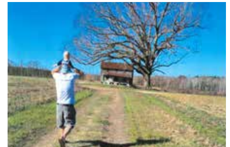
Smith 1819 Farm