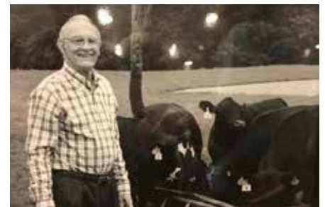
Mount View Farm