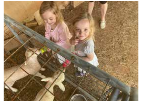
Dunkley Farm - Blue Wing Farm