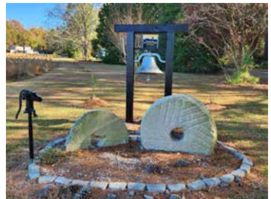
Beaman-Lowe Family Farm