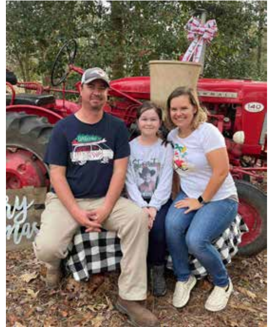
Davis Double Century Farm