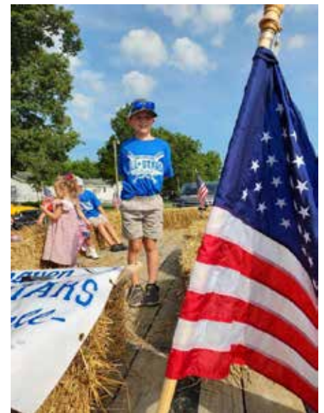
Waters Family Farm