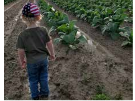
Allen Family Farm