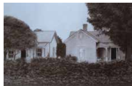
Liles Family Farm