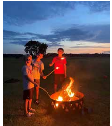
Hardison Full Circle Farm