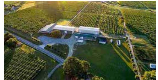
The Hinnant Family Farm