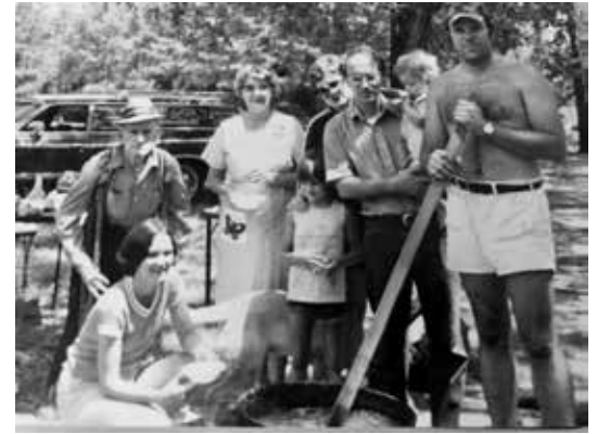
Ellis Farm, LLC