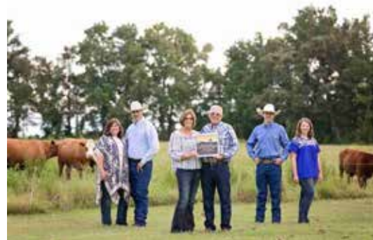
Harris Acres Farm