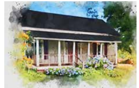
The Buie Family Farm