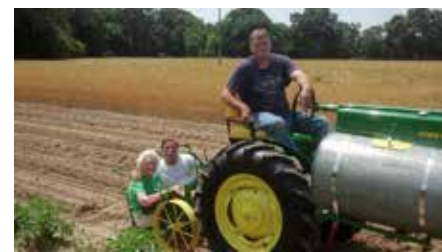
J.H. Parker Farm