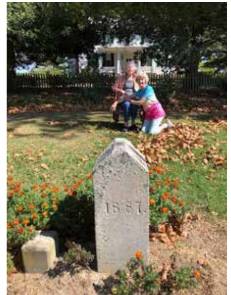
The Joseph Freeman Bicentennial Farm