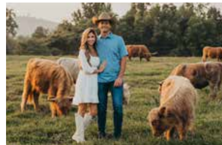
Somers Family Farm