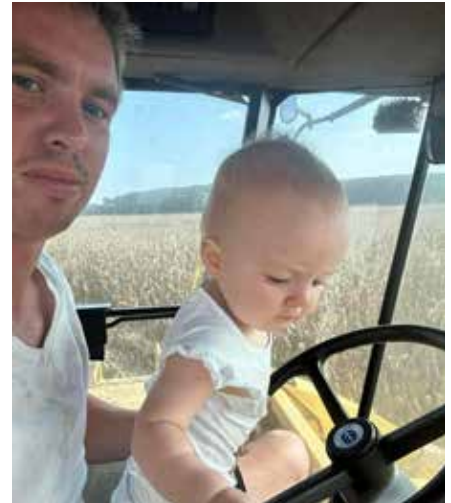
Warrior Ridge Farm