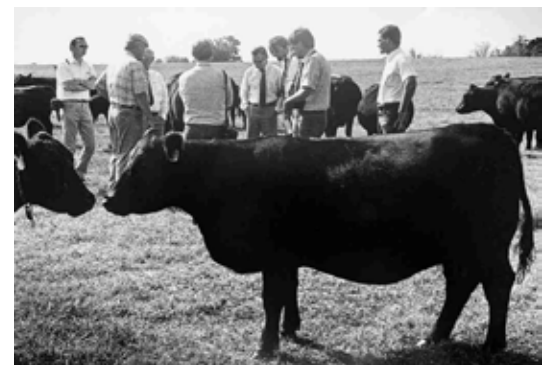
Wakelon Angus Farms