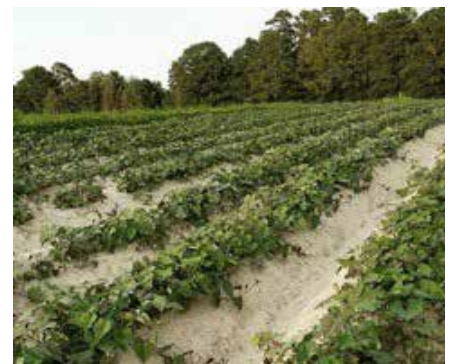
The Johnson Family Farm