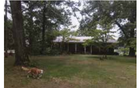
George Washington Jernigan Farm