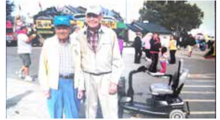
Conyers Family Farms