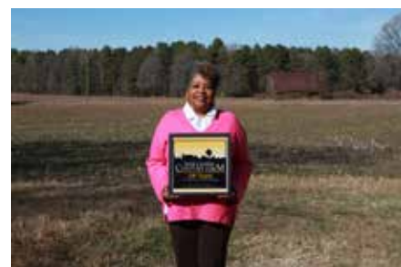
JR Phillips Organic Farm