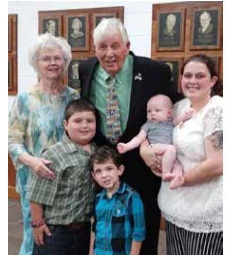
Arrowood Acres Farm