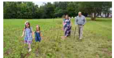
Oak Crest Farm