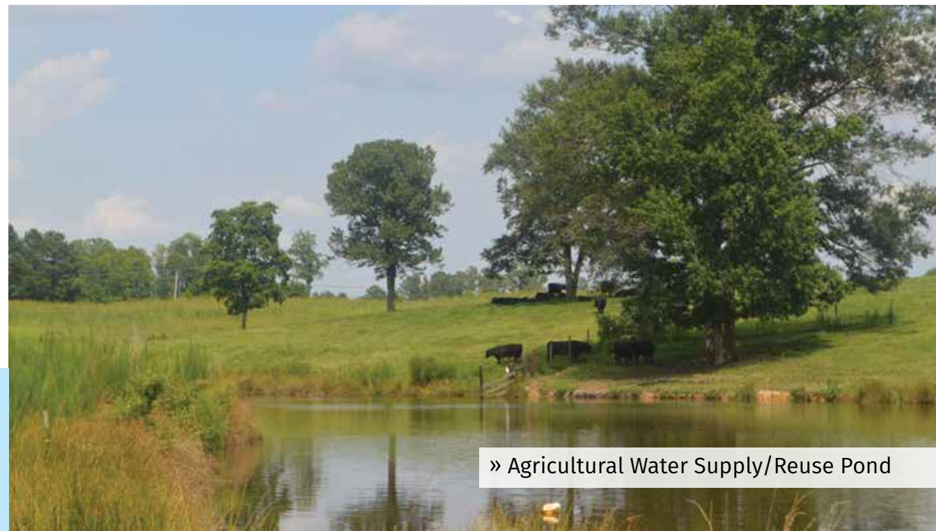
» Agricultural Water Supply/Reuse Pond