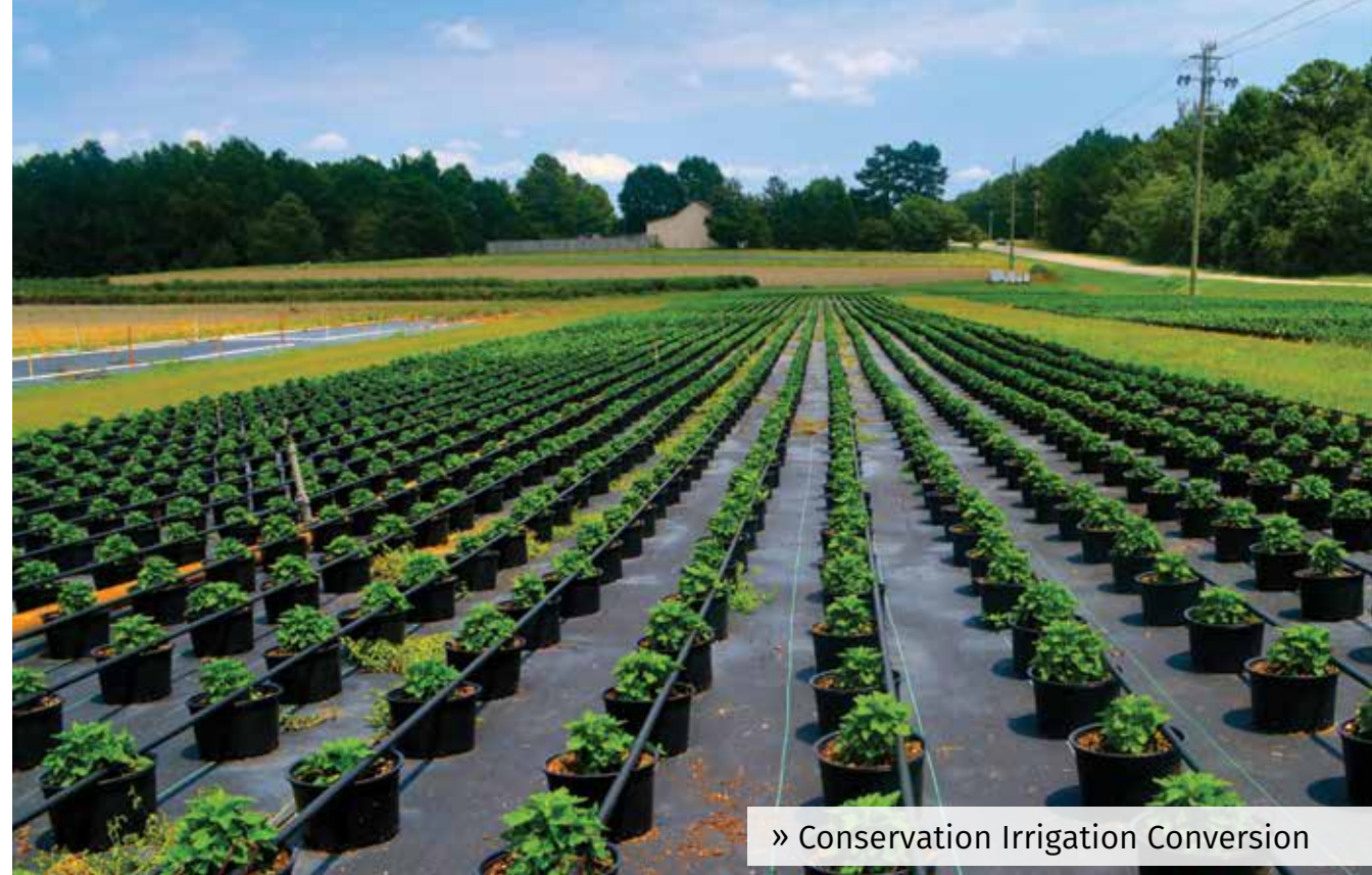
» Conservation Irrigation Conversion

Interested cooperators may apply to their local soil and water conservation district for financial and technical assistance for the installation of BMPs to increase water storage and efficiency. Applicants can be reimbursed up to 75 percent of a pre-established average cost or actual cost for each BMP installed. The applicant is responsible for 25 percent of the costs.