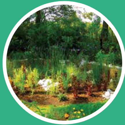
Backyard Rain Garden

Above or below ground storage tanks for rainwater harvesting systems used to collect, store and reuse rainwater. They are intended to reduce stormwater runoff, encourage runoff infiltration while providing water reuse in place of portable water sources.