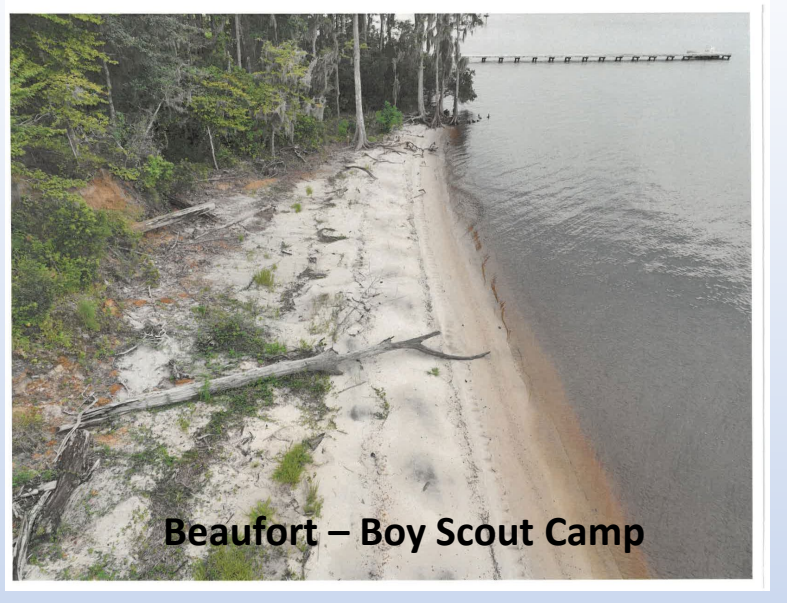
East Region Photos