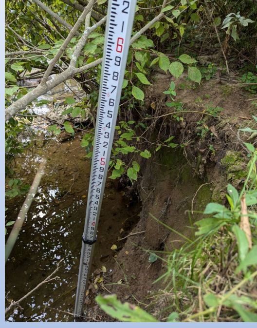
Watauga – Kellwood Townhomes