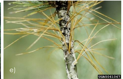
a) Rust spores on the leaf of hybrid black currant. b). Leaves of Ribes spp. infected by white pine blister rust. c). Hair-like spore producing structures on the lower leaf surface of Ribes spp. d). Blister cankers on white pine. e). Infected white pine branch with dying needles